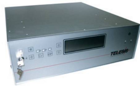
Model E10 Series Controller