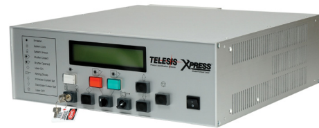
Model XP1 Series Controller