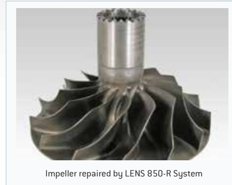
Impeller repaired by LENS 850-R System

The LENS 850-R system offers a large 900 x 1500 x 900mm working volume, making it ideal for repair, rework and modification of large industrial components. The LENS 850-R uses a high-power IPG Fiber Laser to build up structures one layer at a time directly from metal powder. The resulting material has mechanical properties that can be equivalent to or superior than the original component. The 850-R offers a full range of features, including 5-axis CNC-controlled motion, closed loop controls, and full atmosphere control. These features, backed by Optomec's full application and service support, make the 850-R the system of choice for industrial additive manufacturing users.