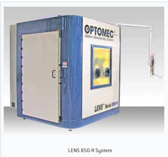
LENS 850-R System

LENS 850-R is a state-of-the-art Additive Manufacturing system, using advanced alloys to restore the functionality of high value metal components.